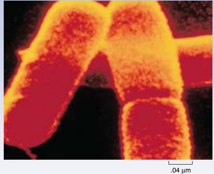
These bacterial cells are dividing. As the population grows, gene variants arise by mutation. Do the new variants persist, or are they eliminated by natural selection?

The removal of variants was proposed to be a very straightforward process. During the periodic cleansing periods envisioned by Muller, his classical model operates under a “competitive exclusion” principle first proposed by Gause: whenever a new variant appears, it is weighed in the balance by natural selection, and either wins or loses. There are no ties. One version of the gene becomes universal in the population, and the other is eliminated.